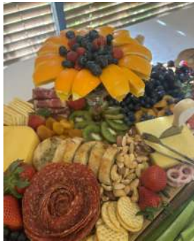
Cahaba Wealth Management